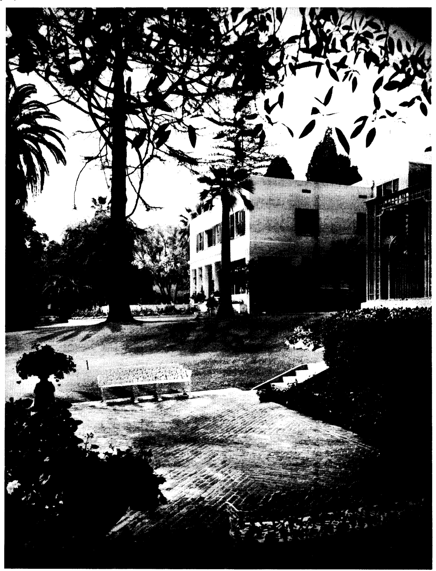
A Portion of the magnificent Ambassador College Campus showing one of four patios, a small portion of the spacious, beautifully contoured grounds, and a corner of the class-room building.